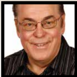
KENNETH W. HAGIN

MANY THINGS CAN be taught from the story of the woman who had a spirit of infirmity for 18 years. (See Luke 13:10–17.) I heard one person who taught on this say that this woman had an inside problem and an outside problem. The Bible says she had “a spirit of infirmity.” She was bent over, which indicates that a paralytic condition